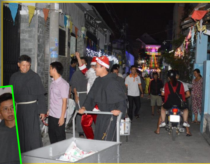
◀ The student friars take Christmas gifts to all the children that live near the Friary